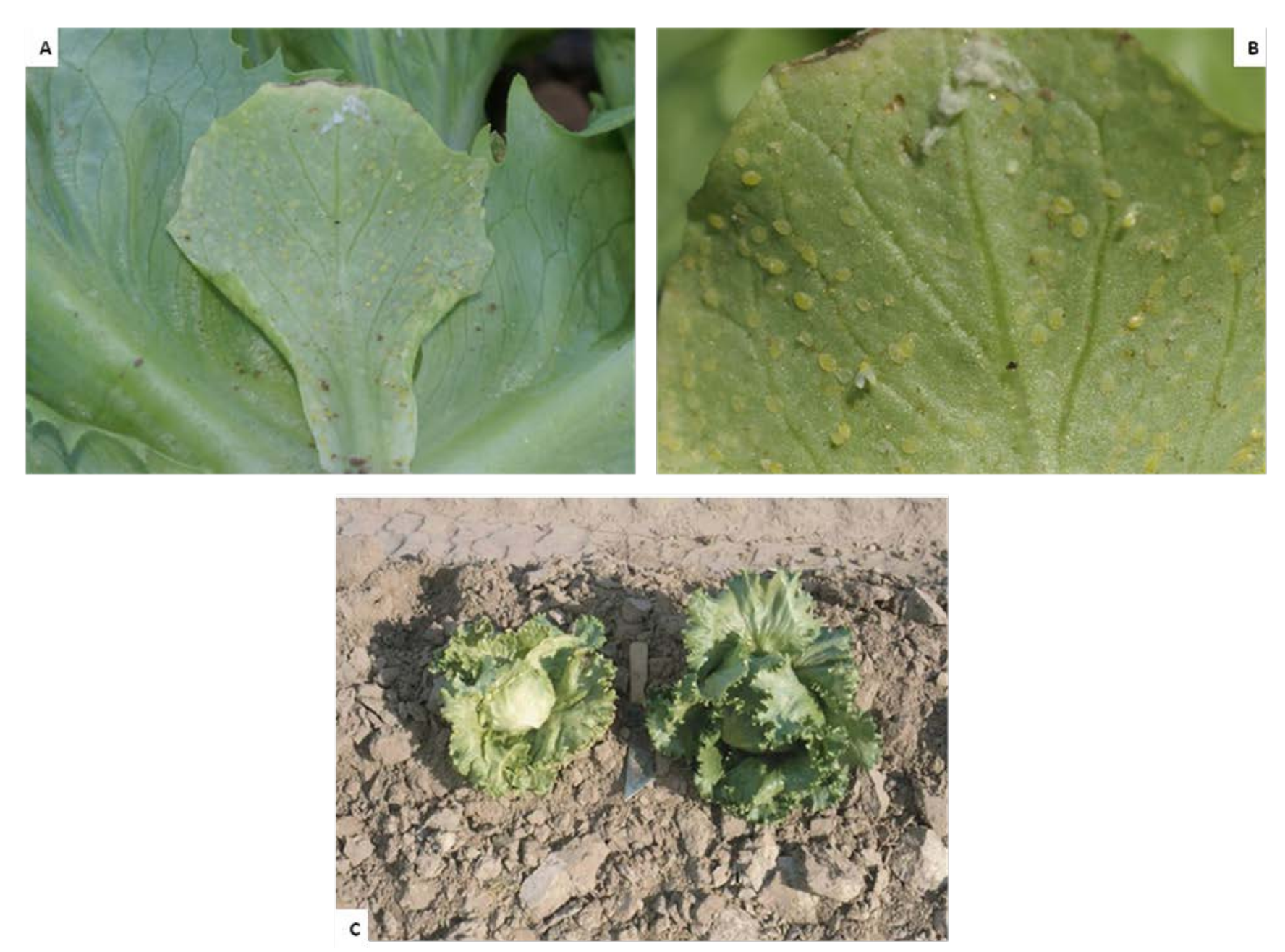
Plate 4. A) SWF nymphs infesting lettuce leaf, B) SWF nymphs on lettuce leaf, (C SWF immature feeding damage to head lettuce (on left); note the reduced size and yellow coloration of leaves and head.