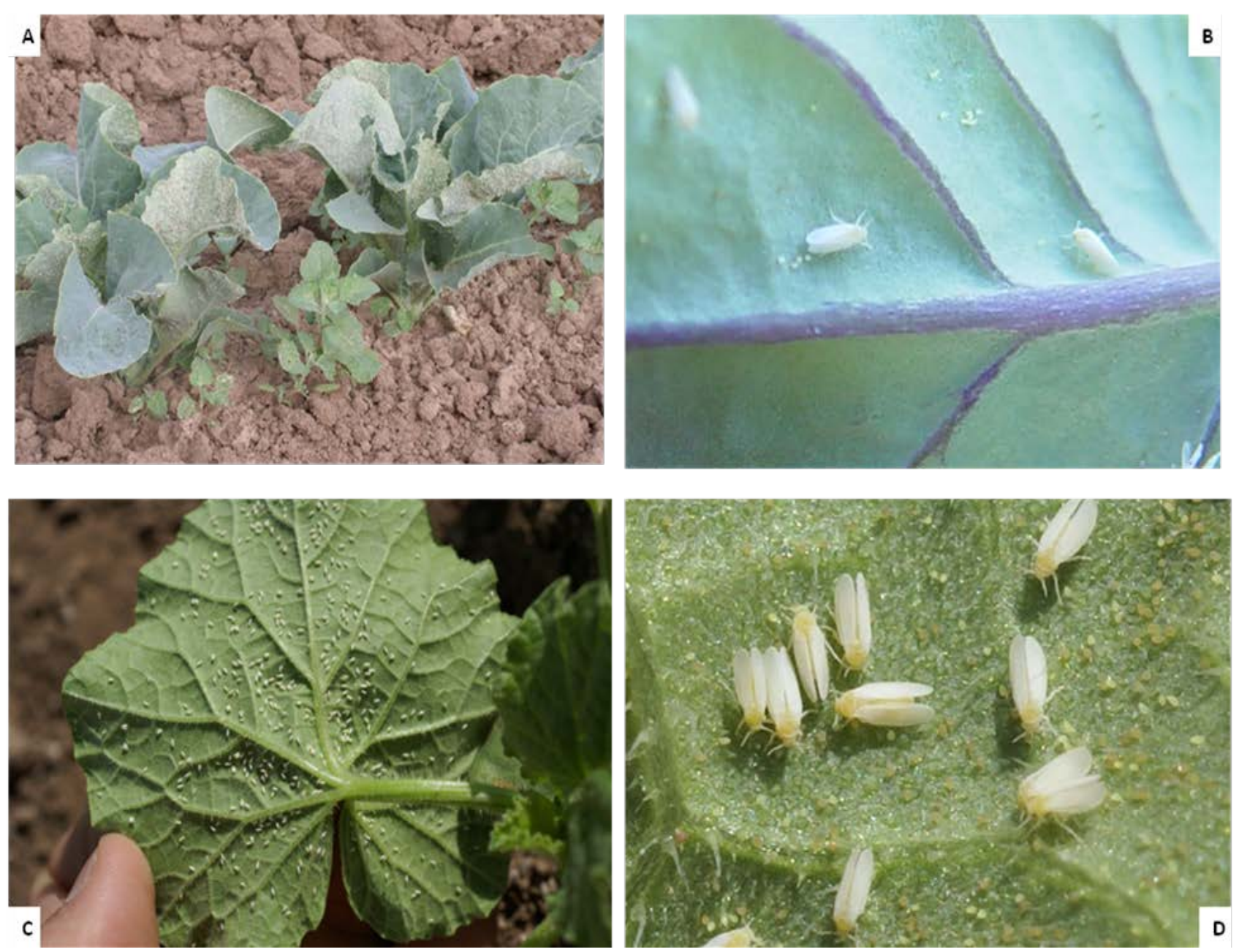
Plate 1. A) Adult sweetpotato whiteflies (SWF) infesting cauliflower plant, B) SWF adult and eggs on Cauliflower leaf, C) SWF adults infesting